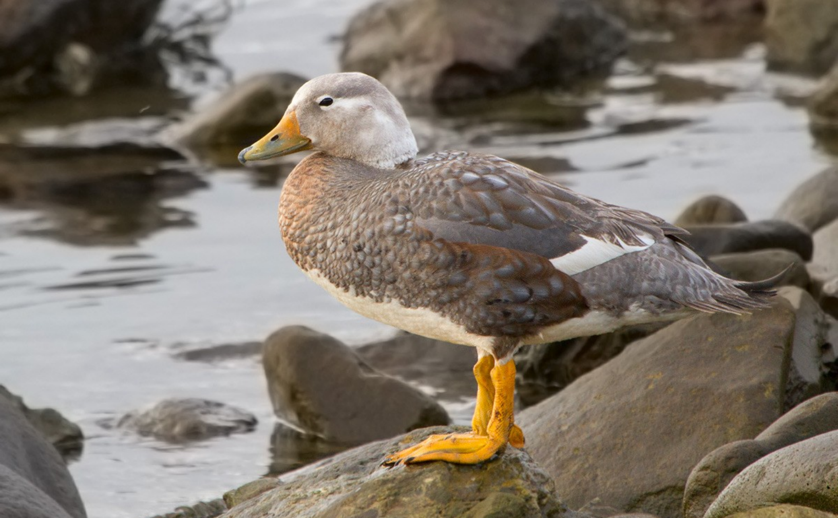
Flying Steamer-Duck