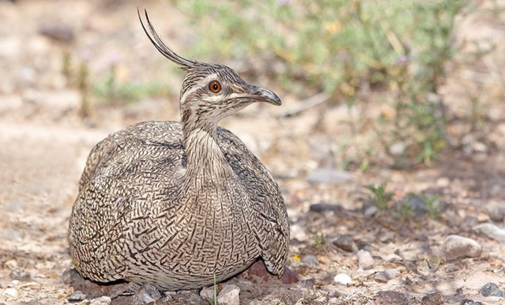
Elegant Crested Tinamou