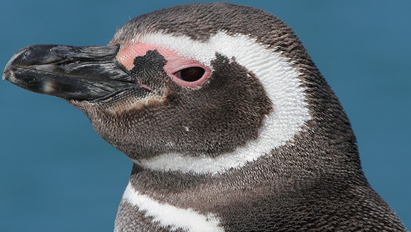
Magellanic Penguin

In Chiloe island we will be looking for coastal species along the shore, such as Peruvian Pelican, Flightless Steamer-Duck, Hudsonian Godwit, Whimbrel, Baird's Sandpiper, Franklin's Gull and more. Inside the island the farmland is a good area to look for Slender-billed Parakeet (Chilean endemic), and the bamboo thickets would give us more chances of finding the rare Ochre-flanked Tapaculo and Des Mur's Wiretail .