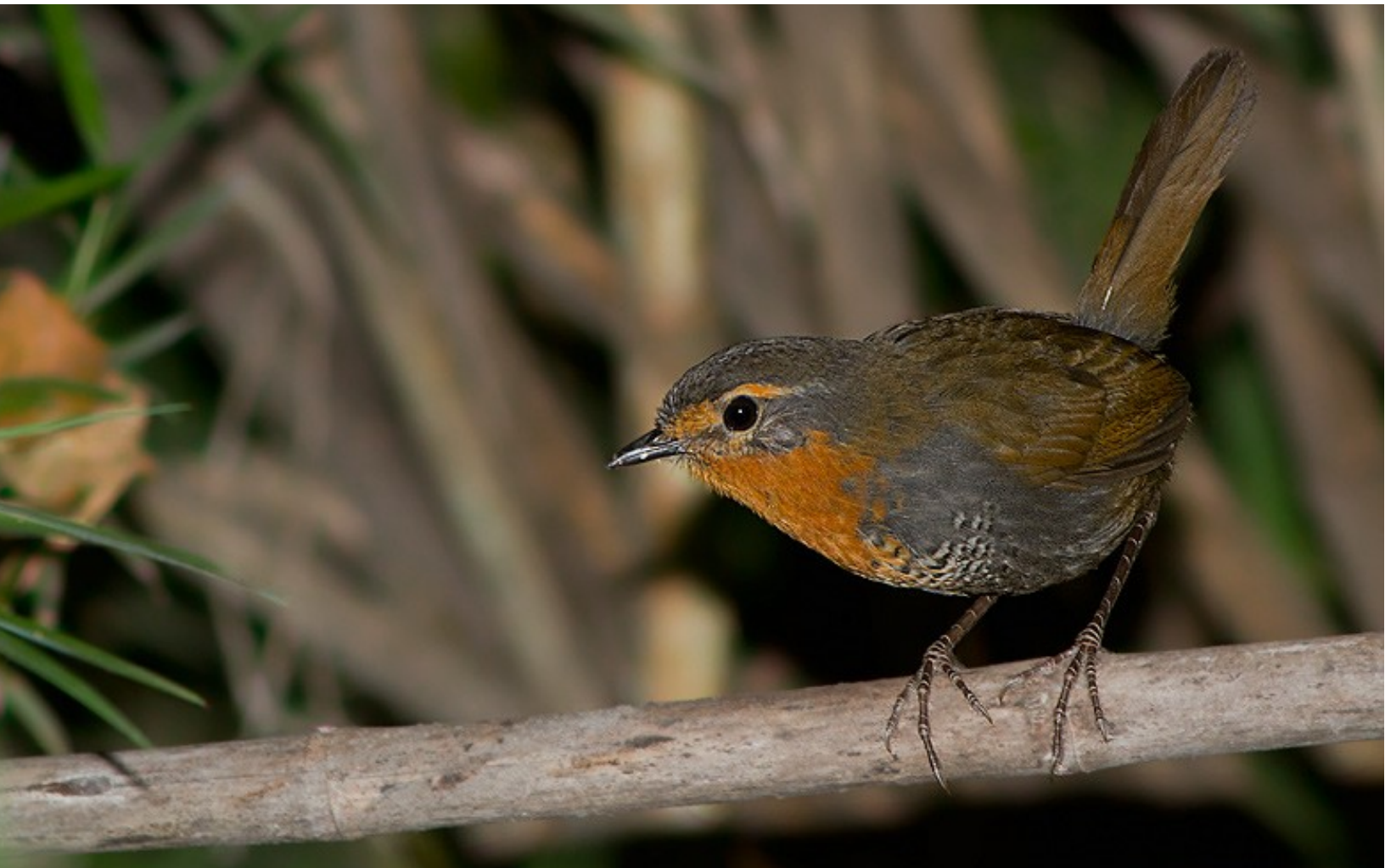
Chucaco Tapaculo