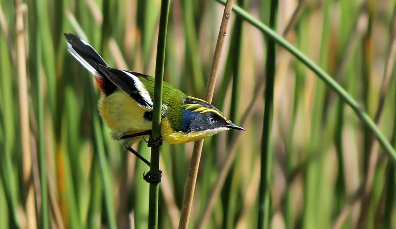
Many-colored Rush-Tyrant

and other reed bed specialties such as Ticking Doradito , Wren-like Rushbird and the grassland dwelling Grass Wren. The adjacent Patagonian steppe could give us Austral Canastero .